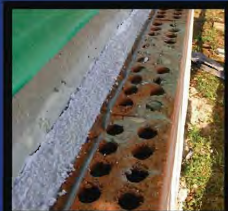
Ura-Fen cavity treatment trimmed