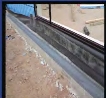
Complete Ura-Fen cavity Perimeter with TERM-seal cord strip and Multi-Purpose coating