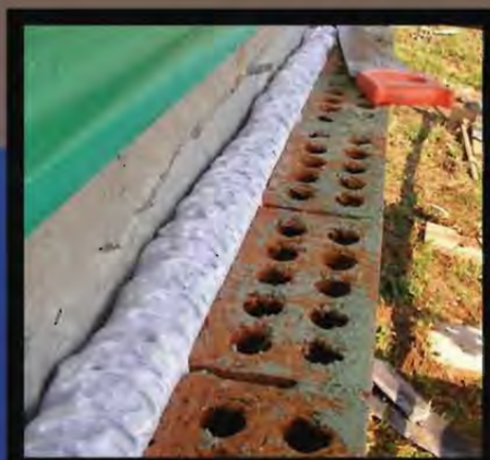
Ura-Fen installed into cavity

With TERM-seal PRM Active protecting the masonry and an application of TERM-seal Multi-Purpose Active coating over the Ura-Fen, provides a termite barrier that will last the lifetime of the building.