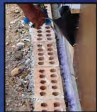
Installing Ura-Fen into Cavity

CONTAINING BIFENTHRIN FOR YOUR PEACE OF MIND